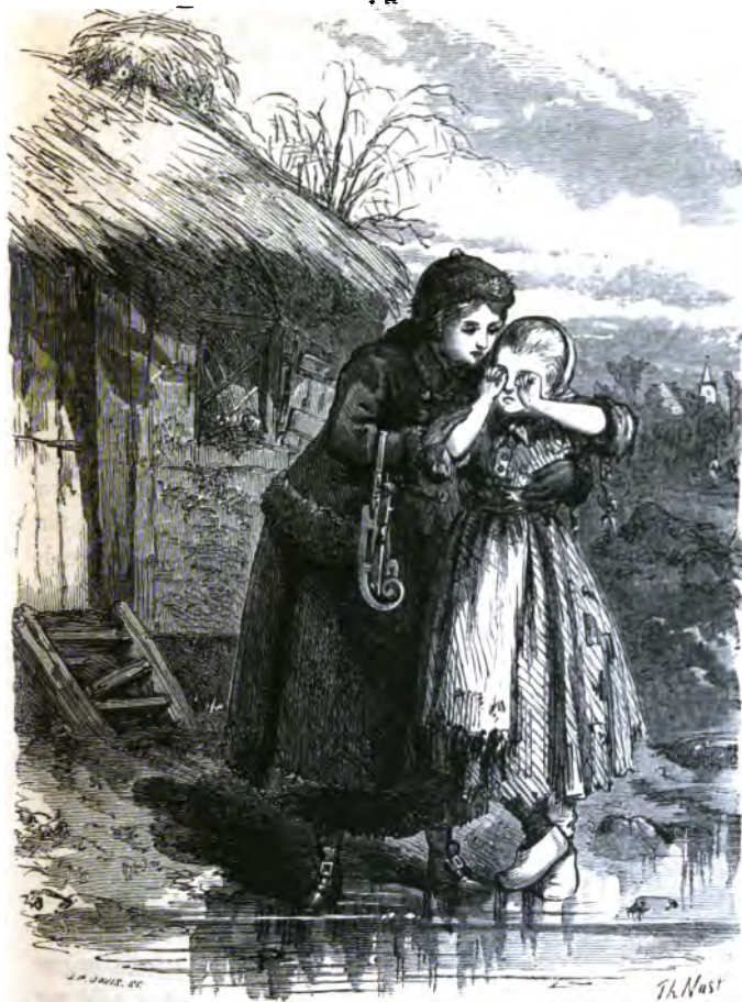
Hilda and Gretel. p. 243.